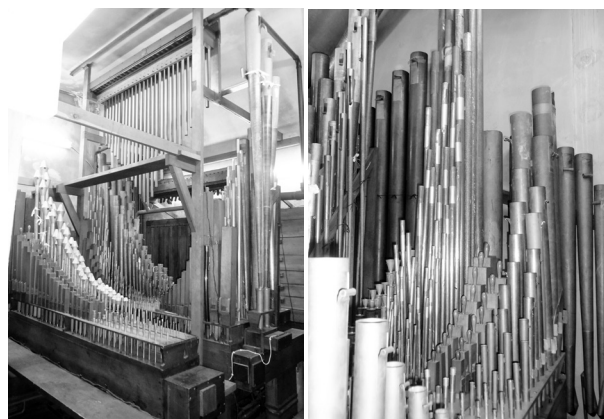
The pipe chambers at Iceland.

If you are looking for a place to enjoy music on a Wurlitzer theatre pipe organ, and perhaps a little fun skating (if you would like to try), come on out to the Paramount Iceland Skating Rink on Tuesdays. Admission is $7.00. It might be wise to bring a jacket and/or blanket if you are sitting in the stands, as it can be a little cold. You can contact Bill Campbell for more information by calling 714-563-9638.