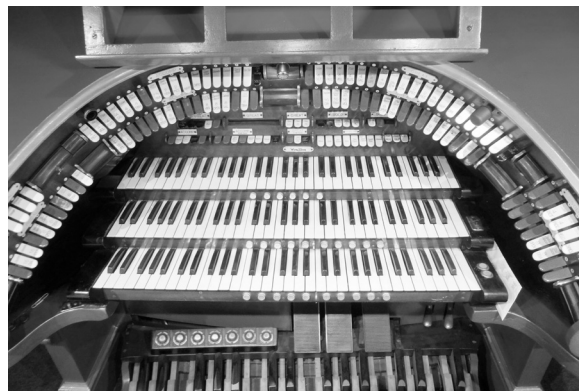
A close-up of the Iceland Wurlitzer console.

Broadway such as Fiddler on the Roof or Annie, and Barry Manilow hits. You may even hear some country western, Beatles and Beach Boys.