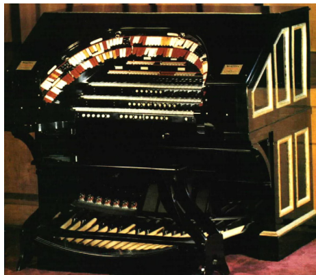
LATOS' South Pasadena High Wurlitzer

"That's My Wife" (1929) starring Stan Laurel & Oliver Hardy. Ollie will receive an inheritance from his uncle as long as he is happily married. After Stan causes Ollie's wife to walk out on him just before the uncle visits, he is pressed into duty pretending to be Ollie's wife with a series of hilarious events that follow.