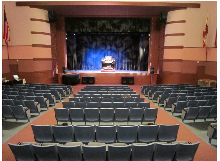
The South Pasadena High School Auditorium with organ on stage.