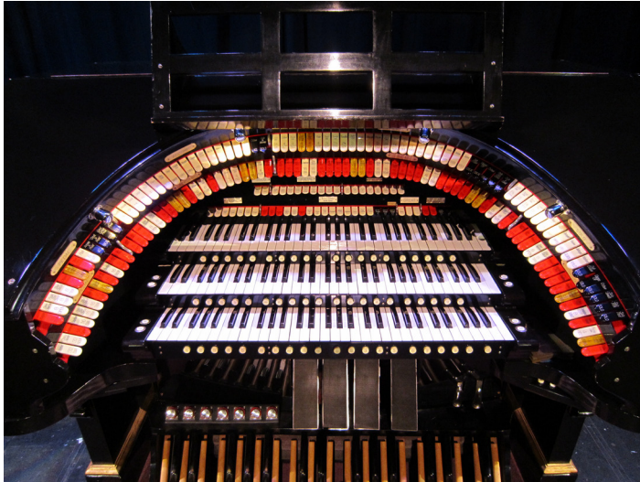
A Close-up photo of LATOS' own Wurlitzer at the high school.

1401 Fremont Avenue, South Pasadena, CA 91030