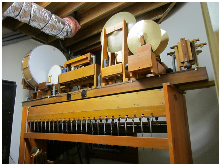
Traps/Percussions Room (other percussions are in chambers).

Special Photo Feature, South Pasadena High School, continued: