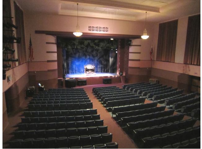
The auditorium was designed by Architects Marsh, Smith & Powell in 1937