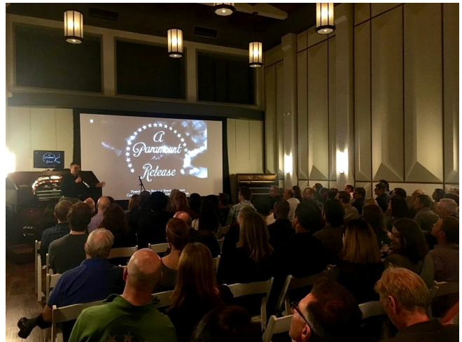
Bandrika up and running it's first silent film concert series