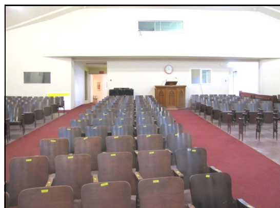
"Bob Baker Marionette Theater," still under construction.